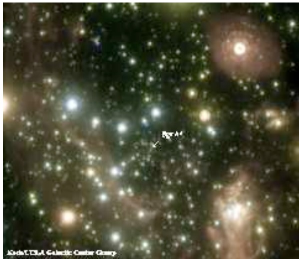
Figure 1: A composite near-infrared (HKL') image of the central 10'' \times 10'' (0.4 pc \times 0.4 pc) of our Galaxy obtained with the laser guide star adaptive optics system at the W. M. Keck telescope. With this and similar set-ups, it has been possible to demonstrate the existence of a supermassive black hole, to detect the infrared emission associated with the black hole, and begin to study the paradoxical young stars in this region. However, even at this resolution (fwhm \sim 60 mas), source confusion is the dominant source of positional uncertainty.

The Milky Way has therefore become a laboratory for learning by example about SMBHs and their environs at the centers of other galaxies. With both existing and upcoming facilities, the next decade of high angular resolution infrared observations offers a promising new era of discovery in Galactic center research.